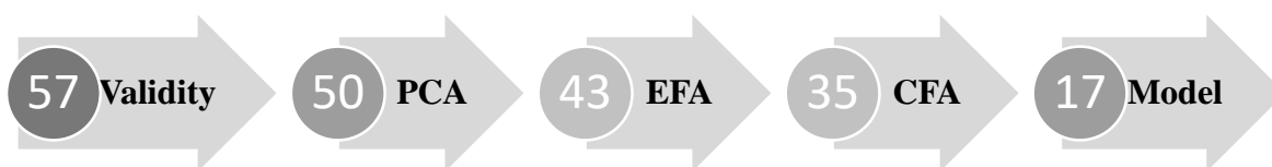
Figure (1) Diminishing of variables from start to the Model

To ensure the rationality of the variables in determining the factors that were previously explored by the exploratory factor analysis, confirmatory factor analysis was used and it turned out that among the 43 observed variables only 17 formed a good fit mode as shown in Table (2) bellow, and later on in Figure (1). For clarity and ease of follow-up to the reader, these variables were named.